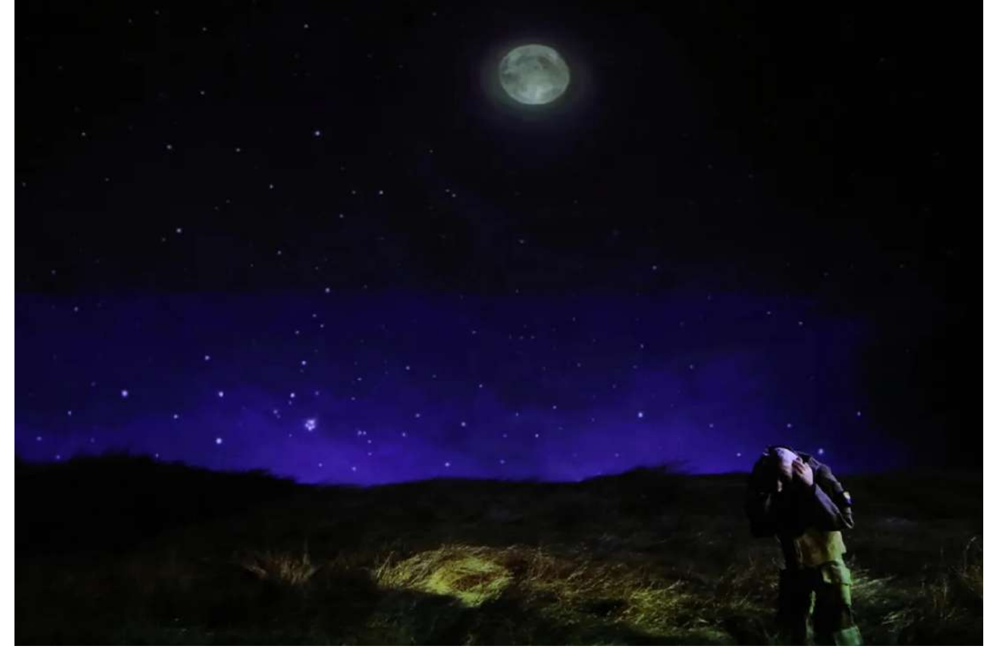
Still from Dana Kavelina, "Such a landscape" (2024), animation

While Ukrainian artists dominated the biennale, it was by no means limited to them. Vietnamese-German artist Sung Tieu presented a claustrophobic take on the "Havana Syndrome" — an alleged sonic attack against American diplomats — through a video based on a three-dimensional reconstruction of the Hotel Nacional de Cuba. Cyprien Gaillard's short film "Ocean II Ocean," which premiered at the 58th Venice Biennale in 2019, depicts New York City subway cars being dumped into the ocean and their subsequent underwater afterlife. Fish swim through the windows and doors of the discarded cars in the silence of the ocean.