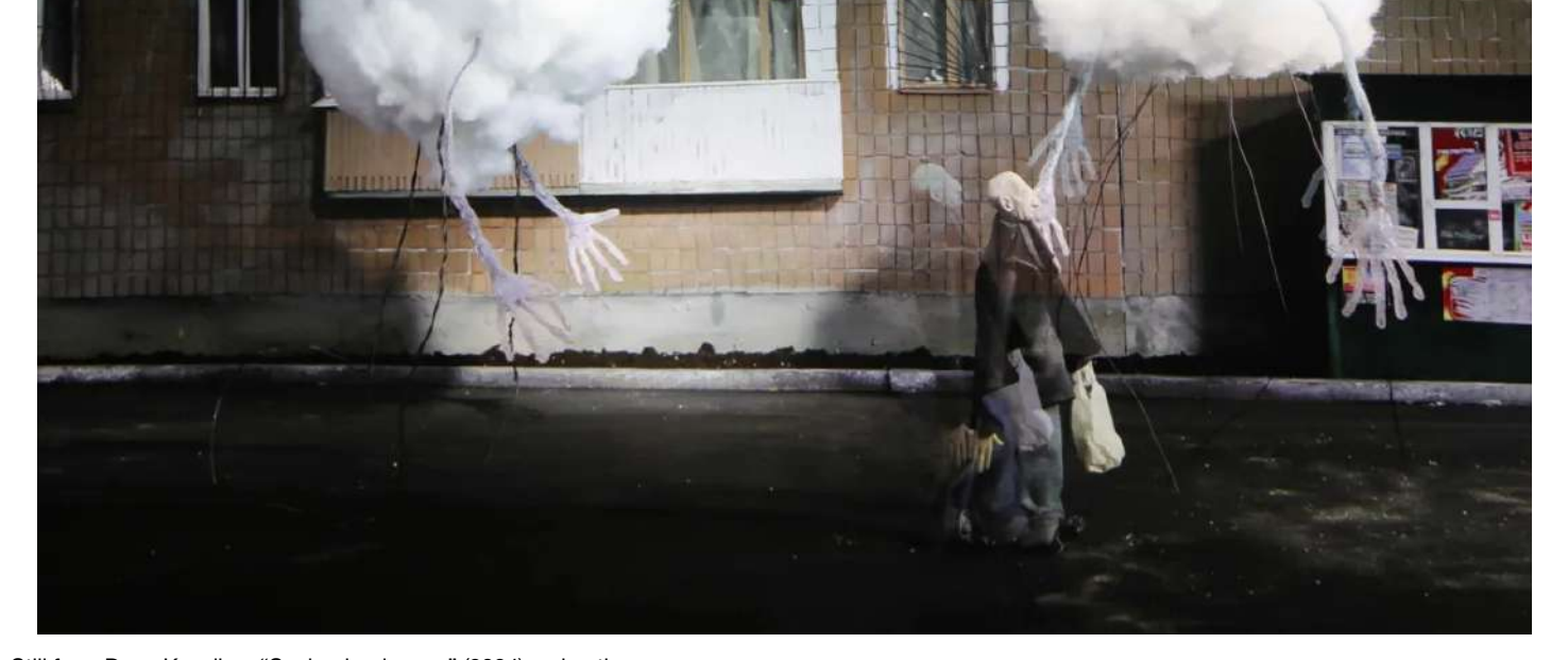
Still from Dana Kavelina, "Such a landscape" (2024), animation