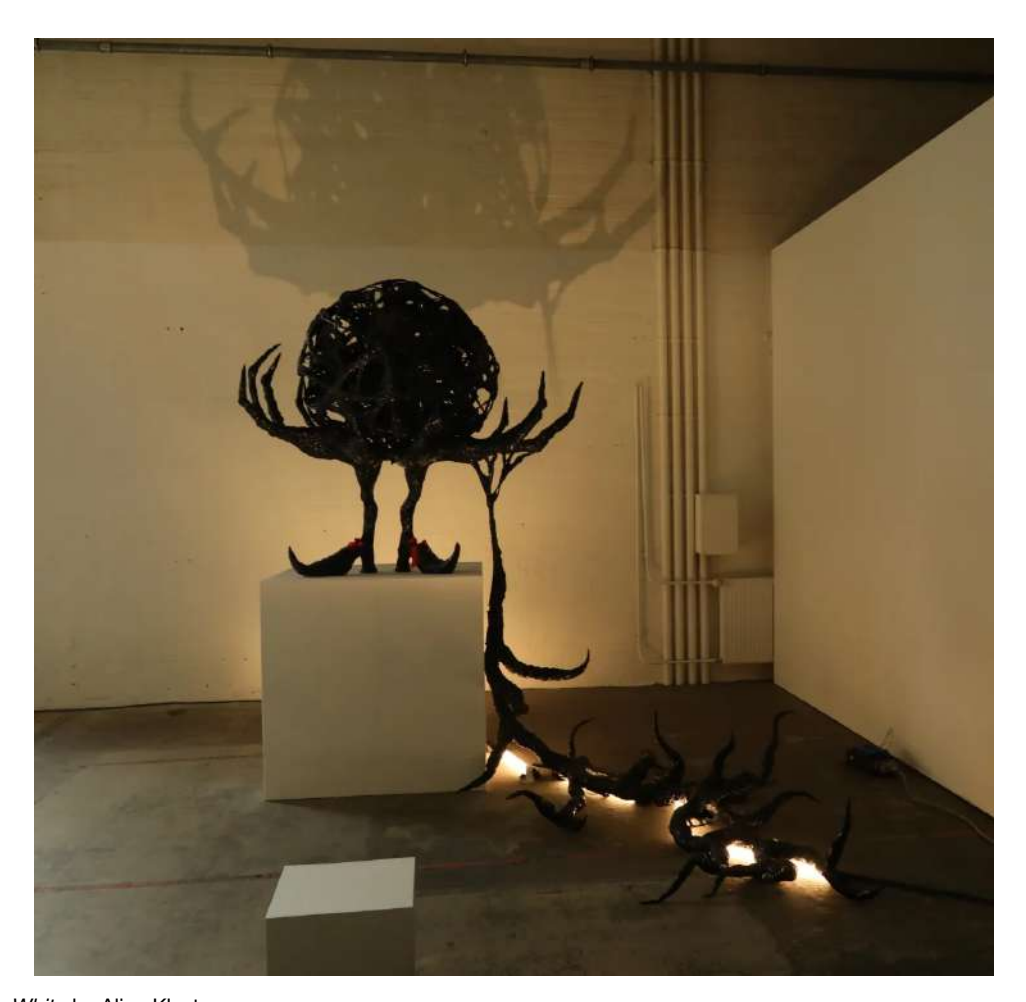
Installation view of Dirty White by Alina Kleytman