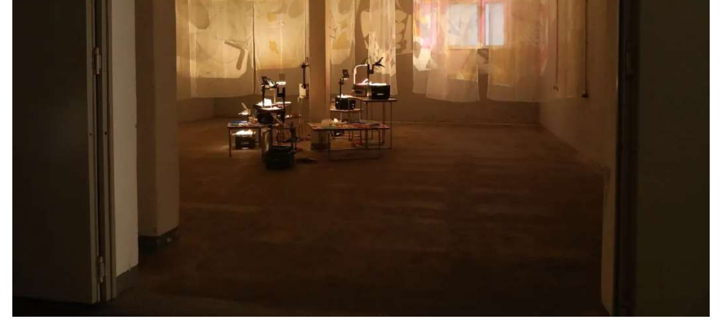
A youth art section at the biennale cleverly played on the event's theme with the title "Ex Oriente Polylux."