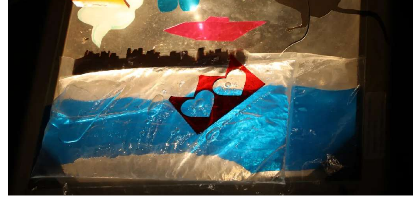
The prompt "What is youth for you?" written on one of the projectors in "Ex Oriente Polylux"