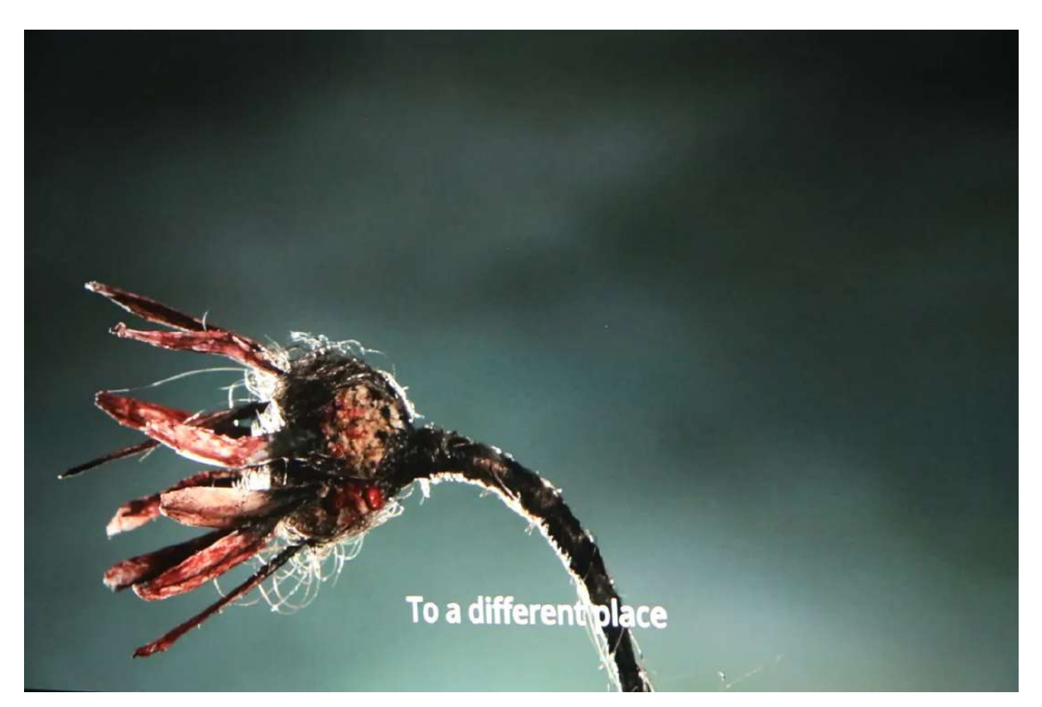
Still from Dana Kavelina, "Such a landscape" (2024), animation