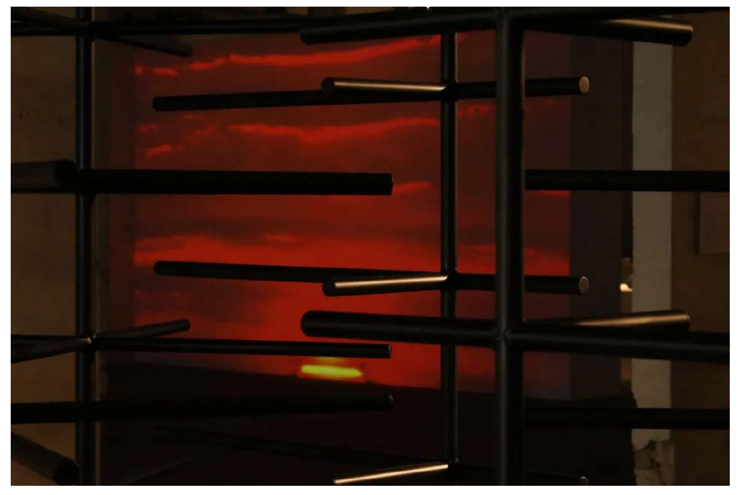
"Tachyoness" (2022), a video by Ukrainian artist Lesia Vasylchenko, viewed through the one-way turnstiles of Danylo Galkin's "Tourniquet" (2013)

media, much of the work on view conveyed images, shapes, and sounds of the destruction wreaked by Russia on Ukraine, and a pervasive sense of fear, war, and death. The name of the biennale itself has its roots both in the history of Chemnitz and the German language: "Pochen" is a polysemic word, meaning to insist, to tap rhythmically on a surface, or to pound, as workers did and still do in the nearby uranium mines.