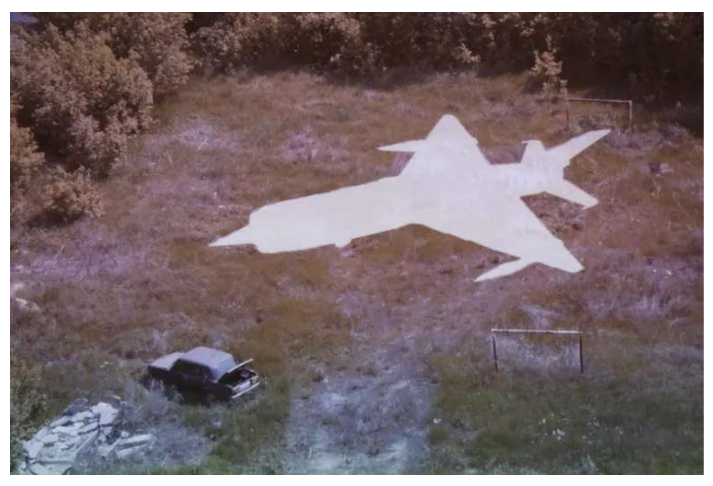
Still from Mykola Ridnyi, "The District" (2022), 20 minutes

a false ceiling released clouds of vapor resembling smoke. This was "European Sleep," an installation by bergenissen (the pen name of Alisa Berger and Lena Ditte Nissen). The nondescript space evoked a gas chamber within what looked like an anonymous, modern office space.